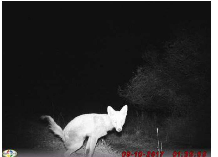
Wild dog captured on motion sensor camera at Bait Site 48, meat bait, taken on 10/09/2017 at 1:35am